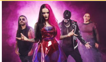
San Marino MEGARA - 11:11